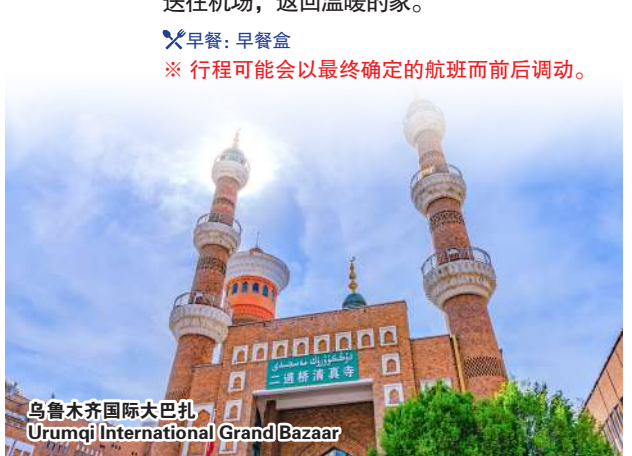
乌鲁木齐国际大巴扎 Urumqi International Grand Bazaar