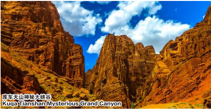
库车天山神秘大峡谷 Kuqa Tianshan Mysterious Grand Canyon

GOURMET: Bohu Fish | Grilled Buns | Roasted Pigeon | Sichuan-Style Cuisine | Xinjiang Pilaf | Xinjiang Noodles