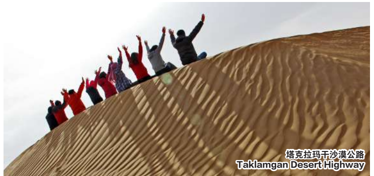
塔克拉玛干沙漠公路 Taklamagan Desert Highway