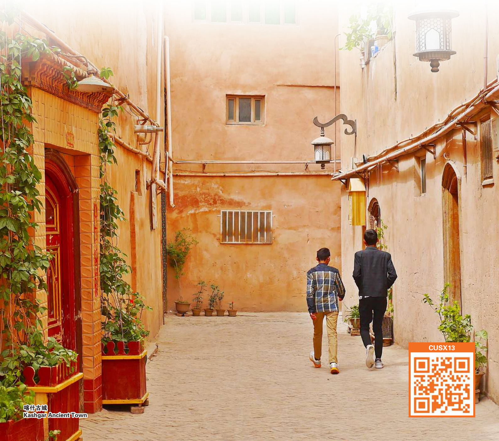
喀什古城 Kashgar Ancient Town

乌鲁木齐 | 库尔勒 | 轮台塔里湖杨林 | 阿克苏 | 喀什 | 卡拉库里湖 | 和田 | 阿拉尔 | 库车 URUMQI | KORLA | LUNTAI TARIM POPULUS EUPHRATICA FOREST PARK | AKSU | KARUKUL LAKE | HOTAN | ARAL | KUQA