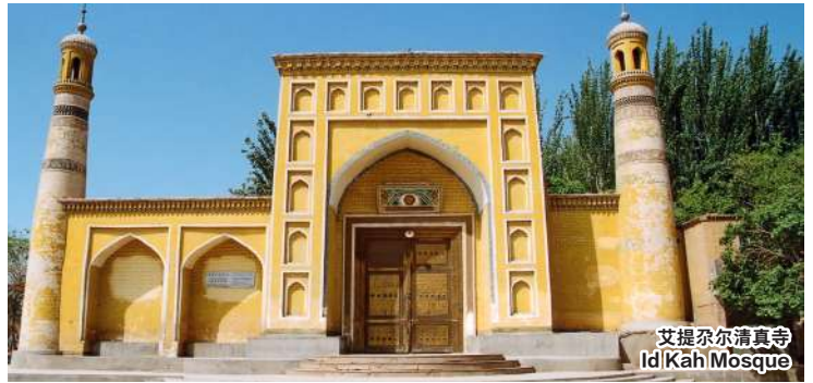
艾提尕尔清真寺 Id Kah Mosque