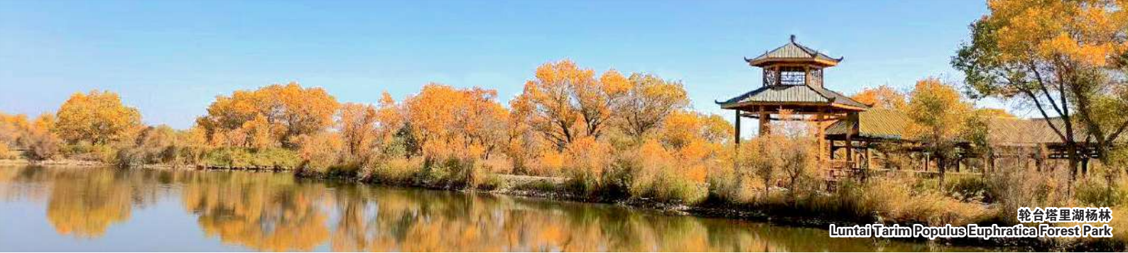
轮台塔里湖杨林 Luntai Tarim Populus Euphratica Forest Park