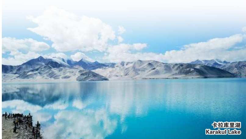
卡拉库里湖 Karakul Lake

✕ 早餐：酒店 | 午餐：当地风味 | 晚餐：当地风味 🏨 阿克苏辉煌酒店或同级