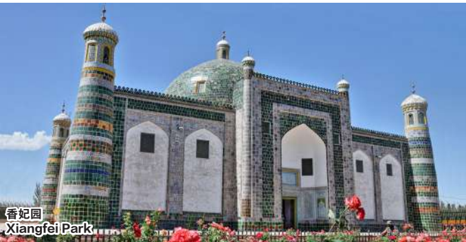
香妃园 Xiangfei Park